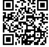
QR Code – LCO Resources Webpage